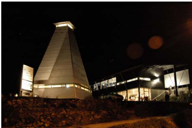
The Spellbound Tower in Waitomo