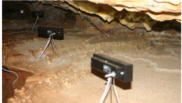
New LED arrays in the Paddy Fields, Wollondilly Cave, Wombeyan