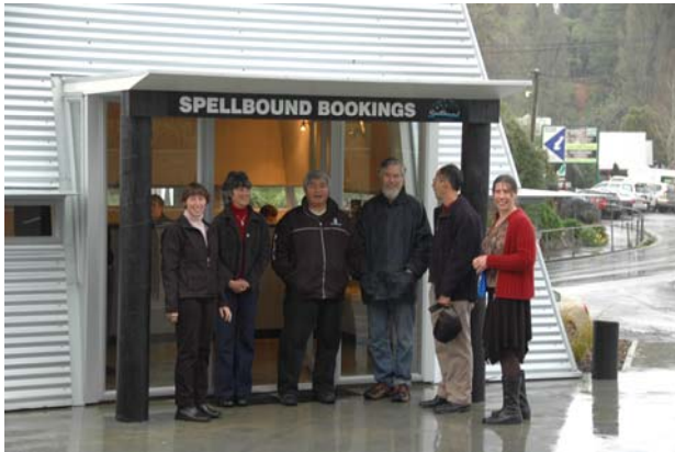
The 'usual suspects' outside the new Spellbound Tours office in Waitomo Village

And also a reminder of the 11th Cave and Karst Presenters Conference at Jenolan, from 10–16 February 2008 . Again, the info and booking form is repeated – as a colourful insert!